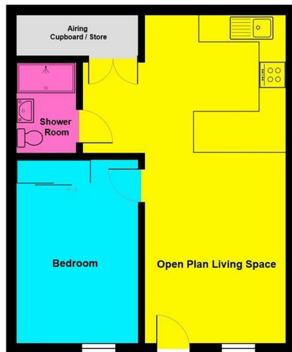
Fleet Court, 25 OLD MILTON STREET, LEICESTER, LE1 3BB

All measurements are approximate and for display purposes only